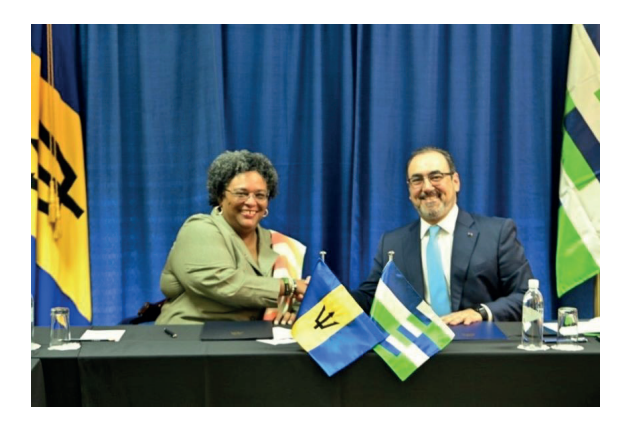
Prime Minister of Barbados with Executive President of CAF

CAF's Executive President paid his first official visit to the Republic of Barbados on August 11, 2023.